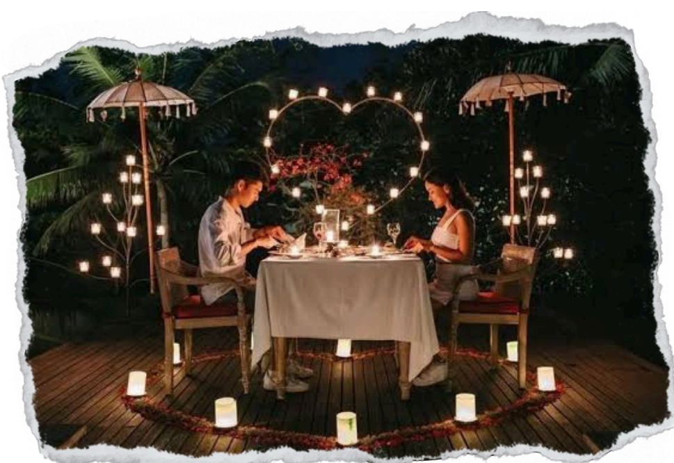
Candle light Dinner